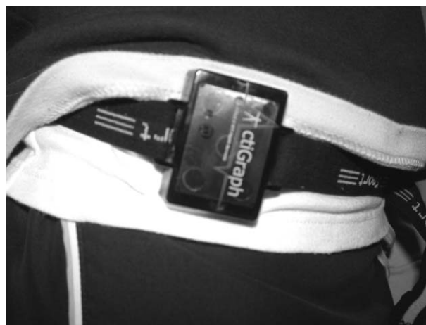
Figure 1 Actigraph uni-axial movement sensor.

During pregnancy a questionnaire containing questions about habitual physical activity was distributed (88). In addition annual questionnaires sent out in childhood have enquired about time spent watching television and time spent engaged in various activities outside the house. At age 10+ all children were asked to take away and complete a 4-day physical activity diary and then return it in a pre-paid envelope. This diary was developed in children of this age (89) and validated against accelerometers – an objective measure of physical activity (correlations between diary and accelerometer measures of activity were 0.7 or greater; A Page, unpublished data). We are currently measuring physical activity at age 11+ over a 7-day period using a uni-axial movement sensor (Actigraph model 7164; Computer Science and Applications, Manufacturing Technology Incorporated, Florida), and plan to repeat these measures at age 13+. This is an electronic motion sensor comprising a single plane (vertical) accelerometer. The monitors are small ( 4.5 \times 3.5 \times 1.0 cm) and light (about 43 g) and are worn in a custom-made pouch (or an elastic belt) around the waist (Fig. 1). Movement in a vertical plane is detected as a combined function of movement